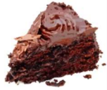
Une tranche de gâteau au chocolat