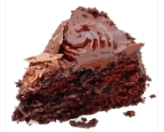
Une tranche de gâteau au chocolat